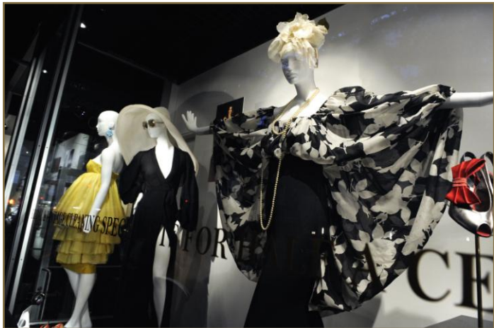
Beautiful window display at Madame Paulette's new Flagship location at 1255 Second Avenue in Manhattan, NY.