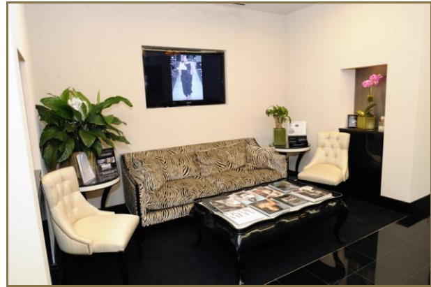
From Left: Full window display of Madame Paulette's boutique, waiting area with custom upholstered furniture.